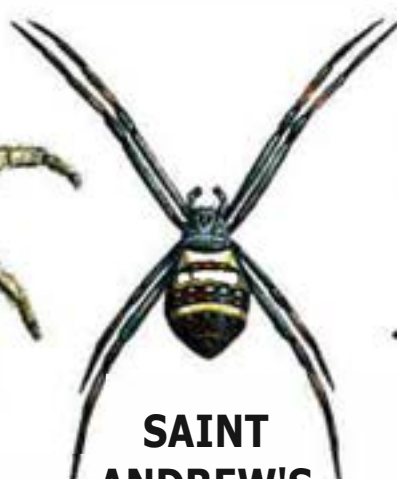
SAINT ANDREW'S CROSS

RELATIVELY HARMLESS • BENEFICIAL OFTEN SEEN IN A LARGE WEB IN THE GARDEN