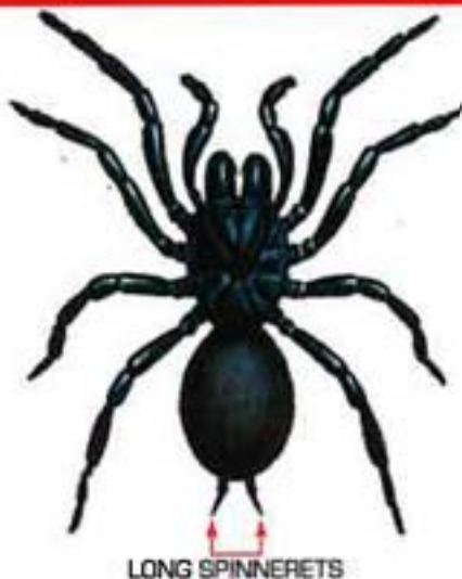
FEMALE SYDNEY FUNNEL - WEB

25 YEAR LIFE-SPAN • AGGRESSIVE • ONE OF THE WORLD'S DEADLIEST SPIDERS