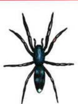
WHITE-TAIL SPIDER MAY CAUSE HORRIFIC ULCERATION TO SKIN OF SENSITIVE PEOPLE FOUND IN THE GARDEN & INDOORS

NOTICE: MALE SPIDERS HAVE A SMALLER ABDOMEN, LONGER LEGS & SWOLLEN PALPS (FOR REPRODUCTION)