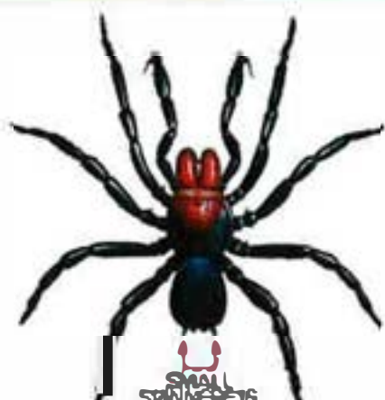
MALE MOUSE SPIDER

ENLARGED HEAD & FANGS • DEEP PAINFUL BITE GROUND DWELLING • OFTEN MISTAKEN FOR FUNNEL-WEB