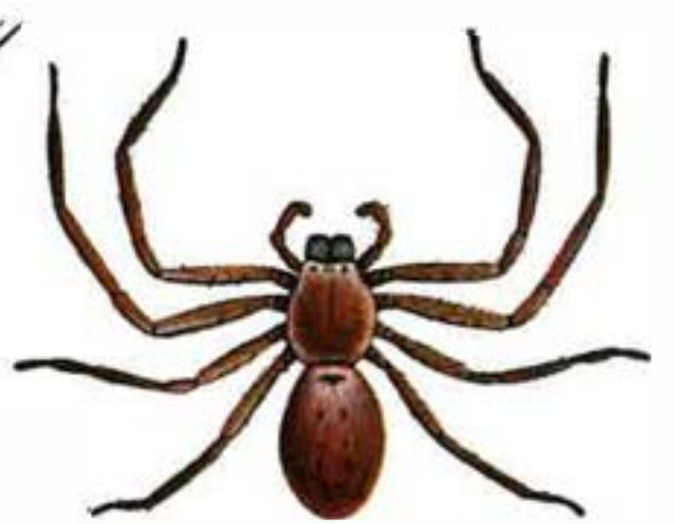
HUNTSMAN | TIMID • RARELY BITES FOUND UNDER LOOSE BARK MAY WANDER INDOORS

SPIDERS CAN BE BENEFICIAL IN THE CONTROL OF MOSQUITOES & FLIES • BUT IF THEY PRESENT A DANGER - CALL Able Pest Control