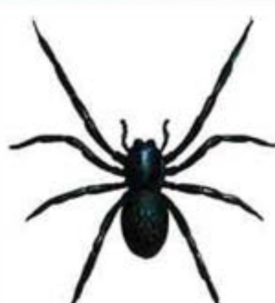
BLACKHOUSE SPIDER VENOMOUS • NAUSEA, SWEATING ETC OFTEN FOUND IN THEIR WEBS IN WINDOW FRAMES, EAVES ETC