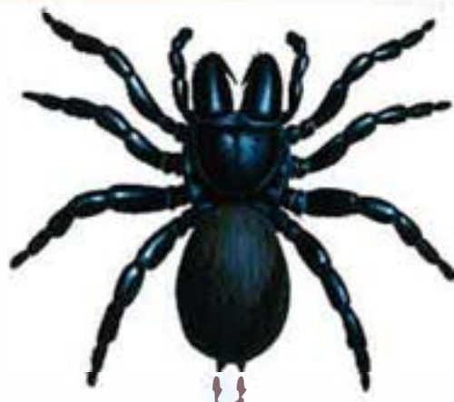
FEMALE MOUSE SPIDER

ENLARGED HEAD & FANGS • DEEP PAINFUL BITE GROUND DWELLING • OFTEN MISTAKEN FOR FUNNEL-WEB