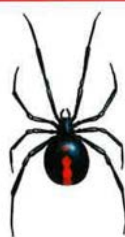
RED-BACK 13 FATALITIES RECORDED FOUND IN RUBBISH, UNDER HOUSE, ETC