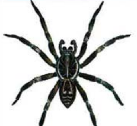
WOLF SPIDER NON AGGRESSIVE GROUND DWELLING

WARNING: MOST OF THESE SPIDERS CAN BE DANGEROUS TO PEOPLE WITH ALLERGIES OR HYPER SENSITIVITIES